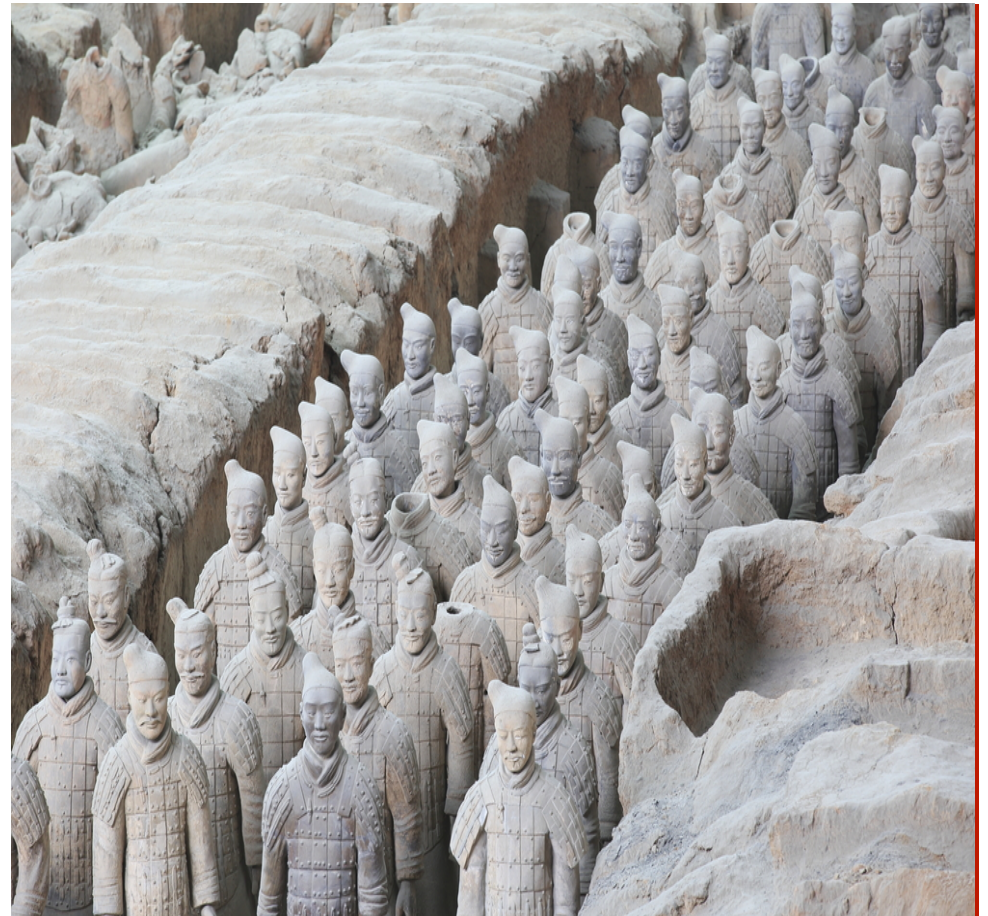
Famous Chinese saying: "All martial arts under heaven arose out of Shaolin."