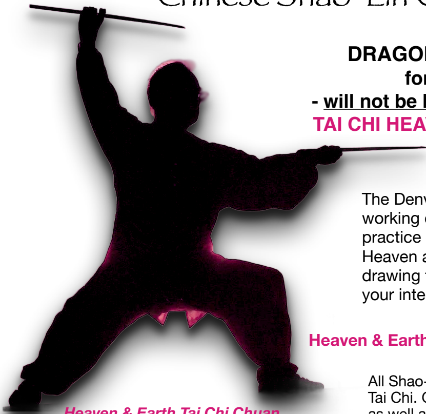
Heaven & Earth Tai Chi Chuan